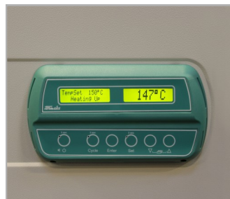
User-friendly LCD display