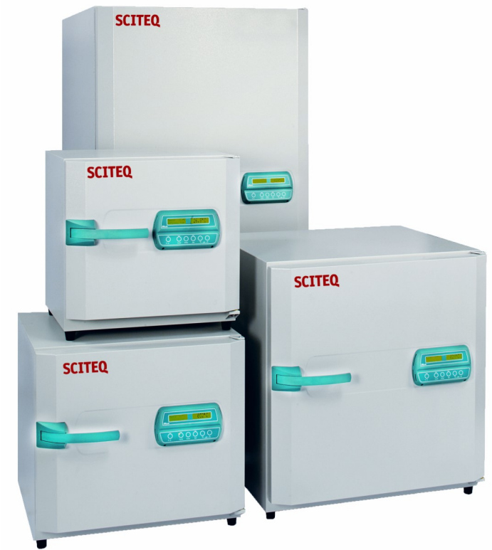
Four different models— volume from 26 l up to 430 l