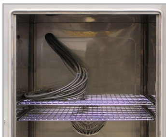
Access port—inside view