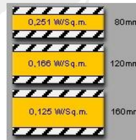
Three insulation thicknesses available