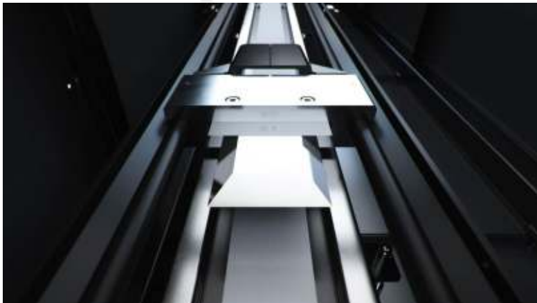
Unique SCITEQ engineered drive